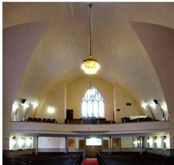
The sanctuary's unique architecture from the altar's viewpoint.