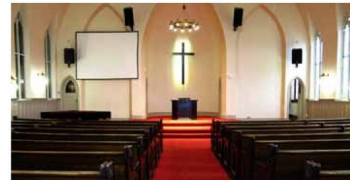
The front stage of the sanctuary.